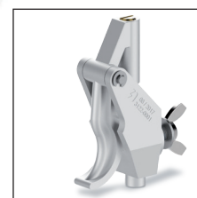
PEBT Low voltage clamp