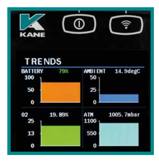
Real Time Trending