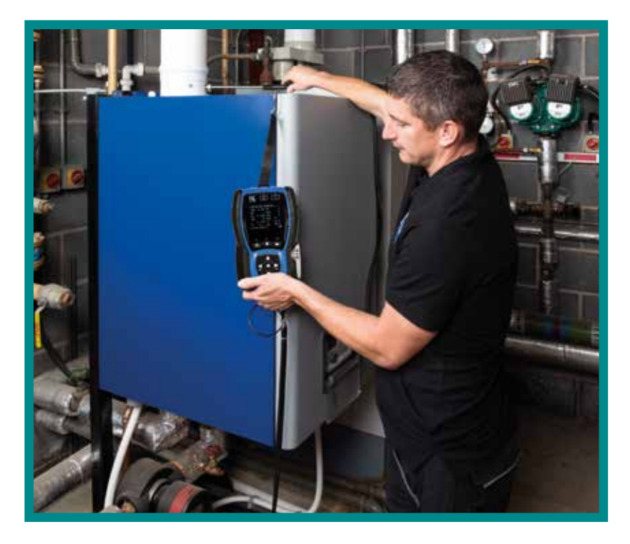
Flue Gas Analysis