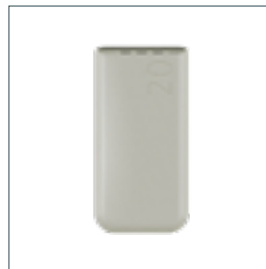
Powerbank – 3 x USB Type-C