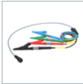
VK 184 – CI connection cable