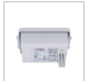
DCI3 Li-ion battery