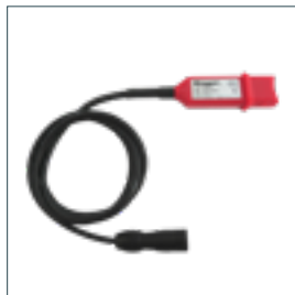
PAS CI – phase identification sensor