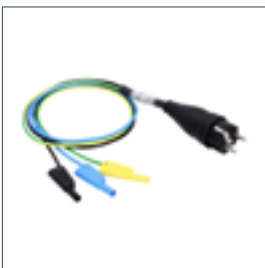
MK 37 – test lead connection for LCI TX to power outlet (EU, UK, US, AUS/CN)