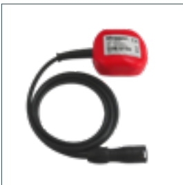
TFS CI – twisted field sensor