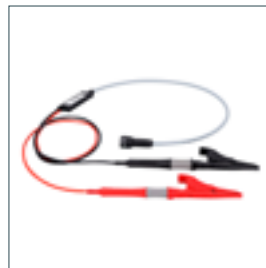
VK185-PI – connection cable for PI