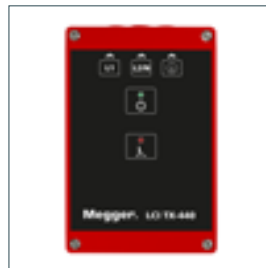
LCI TX-440 – transmitter for LCI (110 - 440 V)