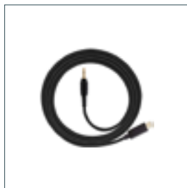
CPIC150-F – connection cable USB-C