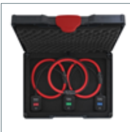
CPIC150-F – set of active clamps