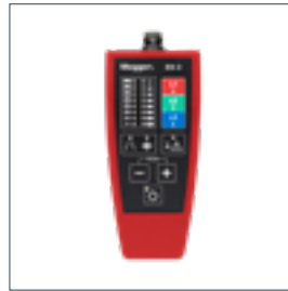
RX3 – receiver