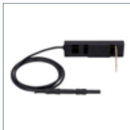
MK 55 – test lead with NH-tap (00-03) for LCI TX