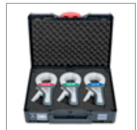
CPIC50 – set of passive clamps