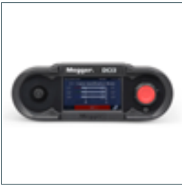
DCI3 – transmitter for CI, PI