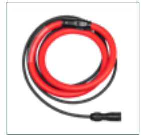
AZF 250-CI – CI flexible clamp